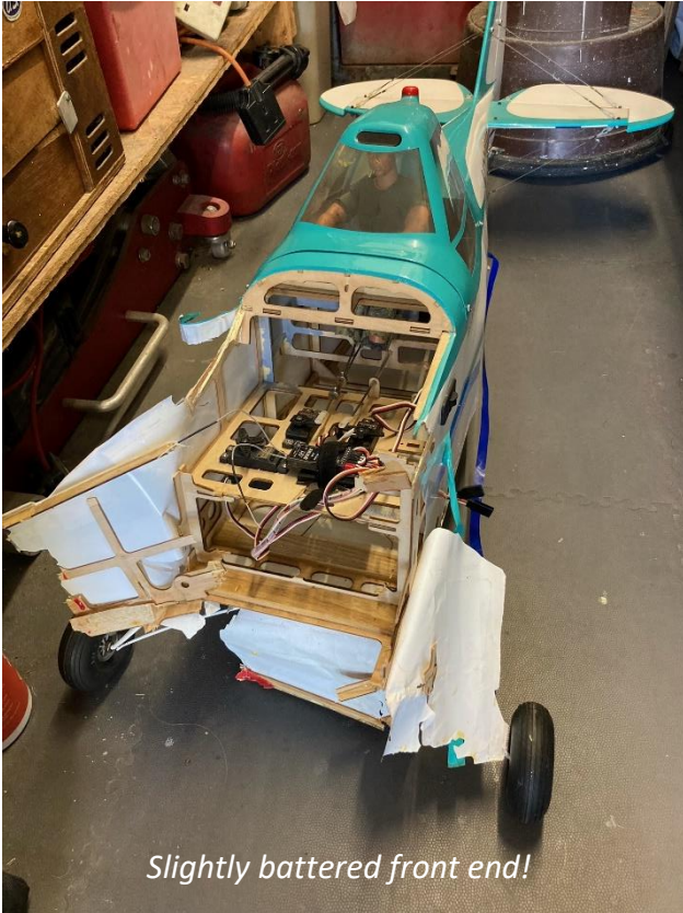
Slightly battered front end!

The Piper Pawnee is one of the few planes I have with flaps. I was practicing landing approaches with the flaps in different positions reducing the amount on each approach. The wind was low but gusting down the runway. On the last attempt the model didn't want to come down, so I aborted the landing, reduced the flaps and made a turn to go around again. Flying downwind the model dropped the left wing, a touch of right stick and the wing levelled only to then drop the right wing, then the left dropped and it hit the fence. I think it was just flying too slow and the gusting tail wind caused the wing to stall.