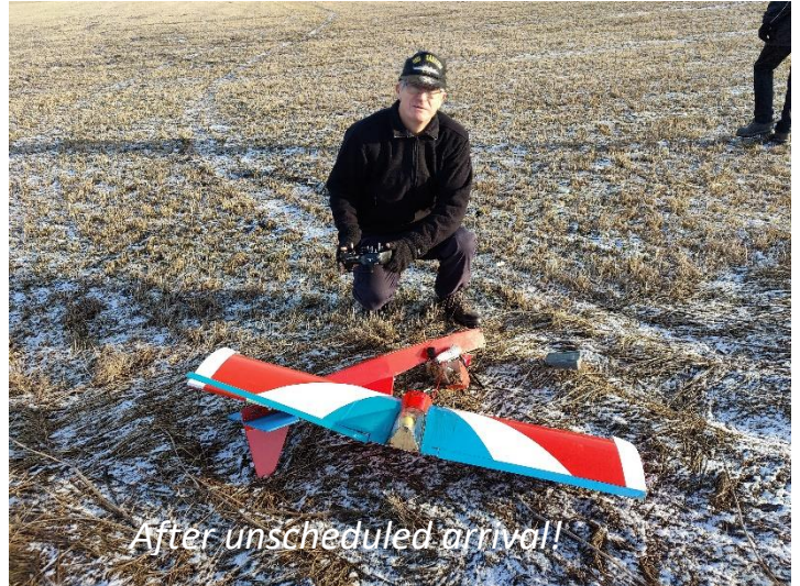
After unscheduled arrival!!

together his Maricardo, took off and flew a few circuits, but then a disaster happened when to the west of the airfield over the farmers track it plummeted to the ground, bounced up then hit the ground again. Neil, Neil and Tom rushed over to the site of the crash and found the wings and fuselage together but the rudder and elevator some distance away. It appears that the elevator became detached at the hinges and this forced off the rudder as well. Repairs are ongoing and it just needs some glue and new hinges before it flies again.