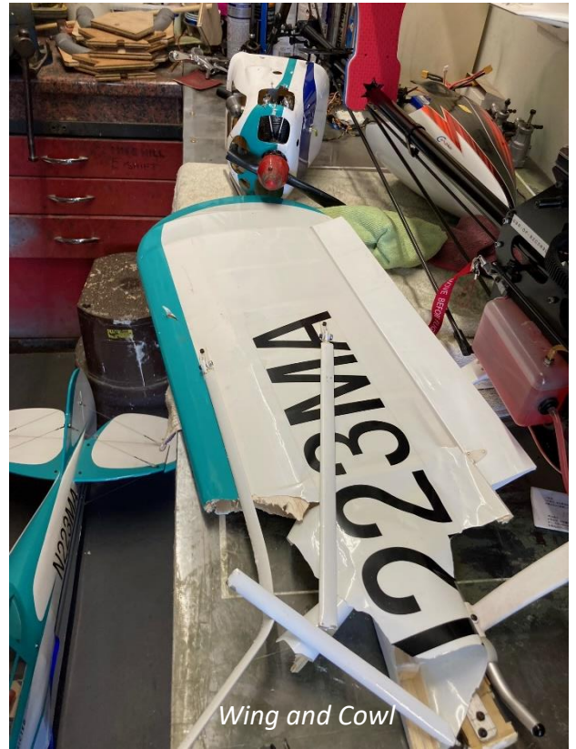
Wing and Cowling

The model has now been rebuilt and is awaiting a test flight and a bit faster flying.