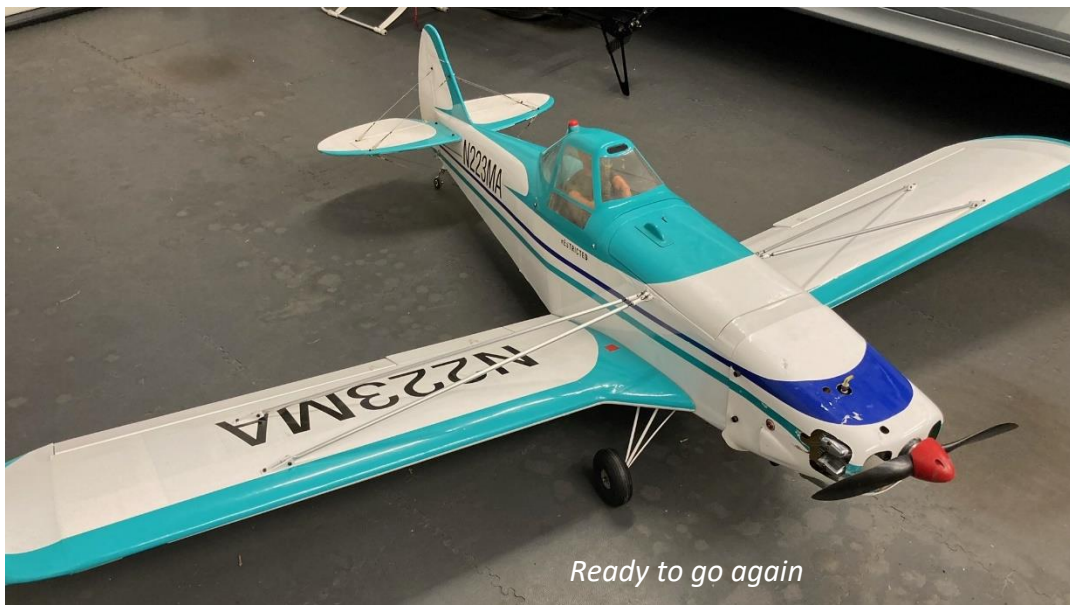
Ready to go again

The model has now been rebuilt and is awaiting a test flight and a bit faster flying.